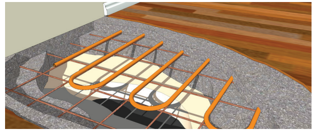
— Kiwi Inslab

The EzyMix screed has removed all problematic issues of cement screeds, and offers a reduced floor thickness and lowered running costs when compared to an in slab solution. A screed floor does increase in the construction costs but having almost zero heat loss to the foundation and ground is a huge benefit. See an estimated breakdown of the costs (right) that can be discussed with your architect and/or builder.